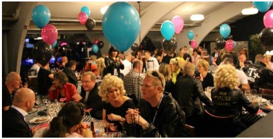
It was a great evening once more in true spirit of Circling and tabling ☺